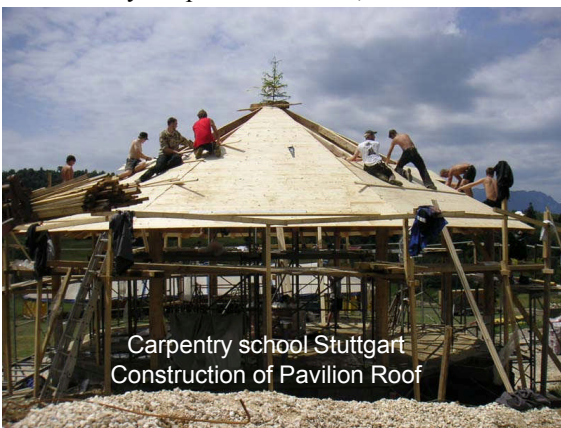
Carpentry school Stuttgart Construction of Pavilion Roof